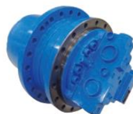
CH series Winch Units