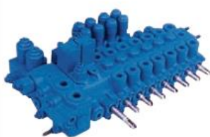
NSS50 series Control Valve