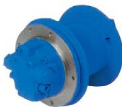
WRD010 series Winch Units