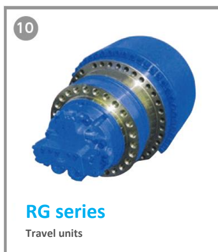
RG series Travel units