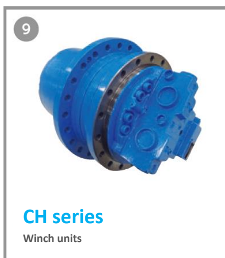
CH series Winch units