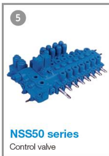
NSS50 series Control valve