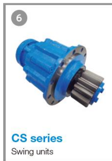
CS series Swing units