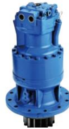
SG series Swing units