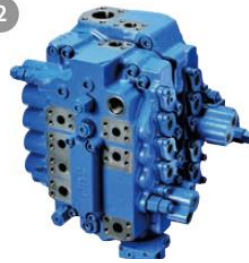
U* series/BCV series Control valve