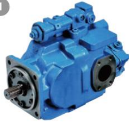
PVC series Variable displacement piston pump