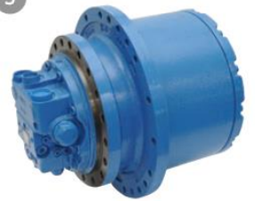
GM series Travel units