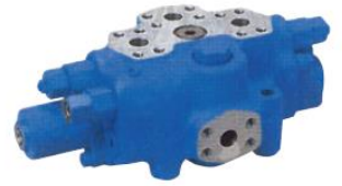
ET series Valve for option